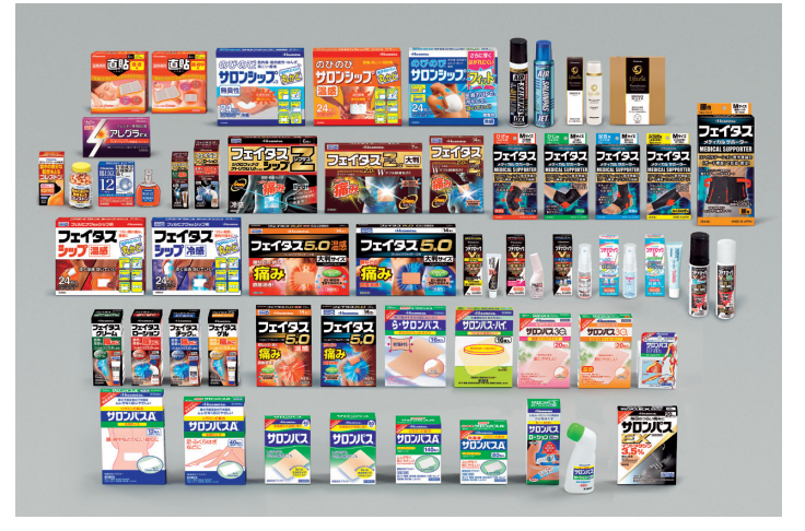
Over the Counter Products