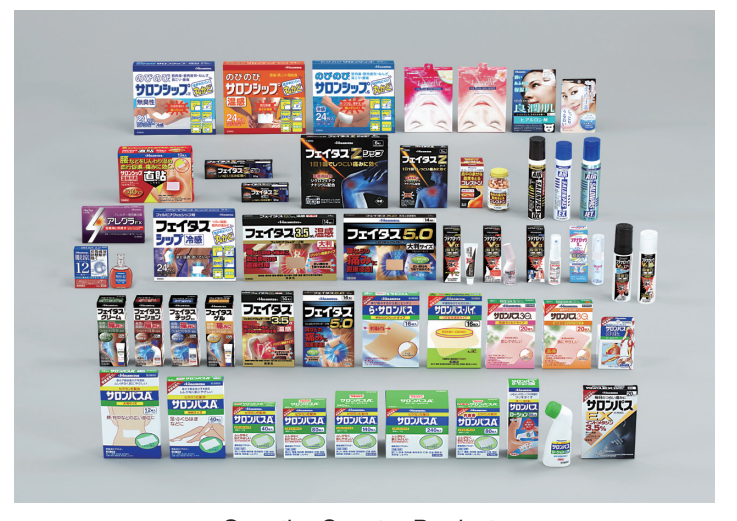
Over the Counter Products