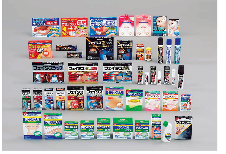
Over the Counter Products